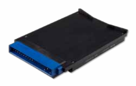
Figure 4: XPm2010 Power Supply