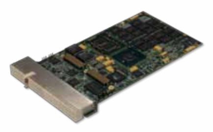
Figure 2: XPedite7332 Core i7 CPU Board