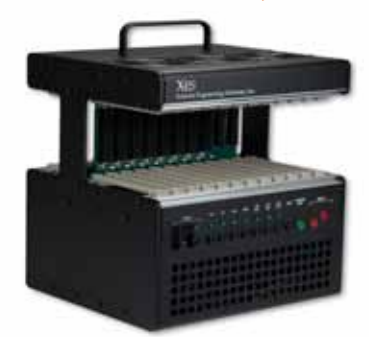
Figure 5: XPand1300 Air-Cooled Chassis