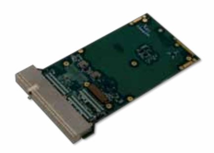
Figure 3: XChange1200 PMC/XMC Carrier