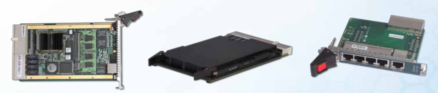
Figure 1: Cisco 5940 Embedded Service Router (ESR) Air-Cooled, Conduction-Cooled, and RTM

X-ES integrates the Cisco® 5940 Embedded Services Router (ESR) into airand conduction-cooled 3U CompactPCI (cPCI) systems. The Cisco 5940 ESR is complemented by Cisco IOS Software and Cisco Mobile Ready Net capabilities. With this technology, X-ES systems can provide highly-secure data, voice, and video communications to stationary and mobile network nodes across wired and wireless links.