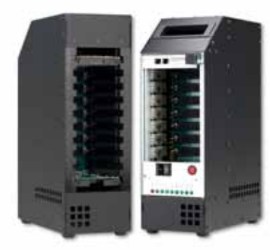
Figure 6: XPand1200 Conduction-Cooled Chassis